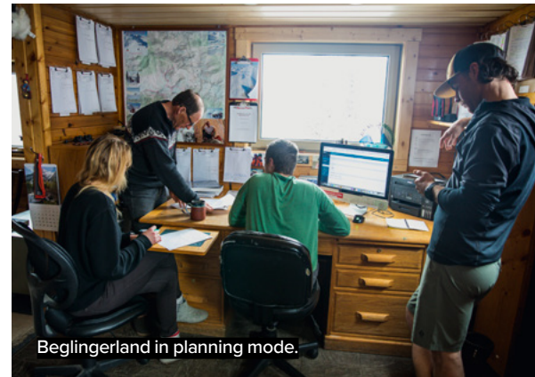
Beglingerland in planning mode.