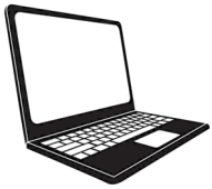
Lap Top Computers